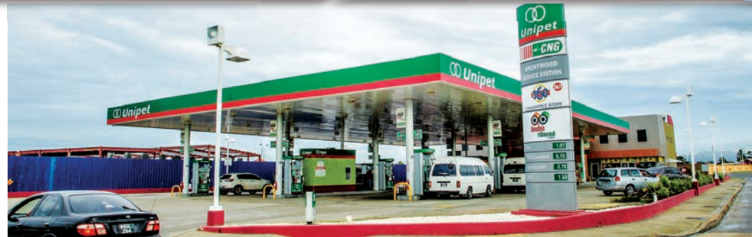
Brentwood Service Station, Chaguanas, supplying CNG since 2014

Refuelling with CNG will become easier and more accessible with the opening of several new CNG supply points (gas stations) and the deployment of five (5) Mobile Refuelling Units (MRUs). The new supply points will be located in close proximity to all the major thoroughfares across Trinidad and Tobago. This is good news for motorists switching to CNG.