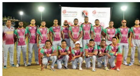
NGC T20 Cricket finals, Alescon Comets from Charlieville

Apart from the usual necessities such as equipment, uniforms and other expenses, these funds have been heavily invested in training and development. Leaders have