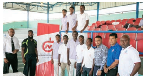
Grassroots Developmental Programme, Tobago – Cricket Launch