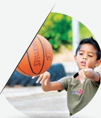
NGC RIGHT ON TRACK