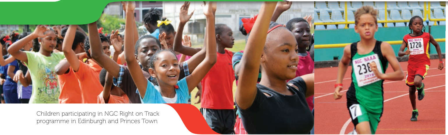
Children participating in NGC Right on Track programme in Edinburgh and Princes Town