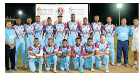
NGC T20 Cricket finals, Queen's Park Cricket Club (QPCC) from Port of Spain

But cricket doesn't have to reach the international level to be positive and impactful on our society. At one such event, the NGC Group T20 Cricket finals staged at the National Cricket Centre in Balmain, Couva on Friday 15th April 2016, produced an exciting victory for Queen's Park Cricket Club over Alescon