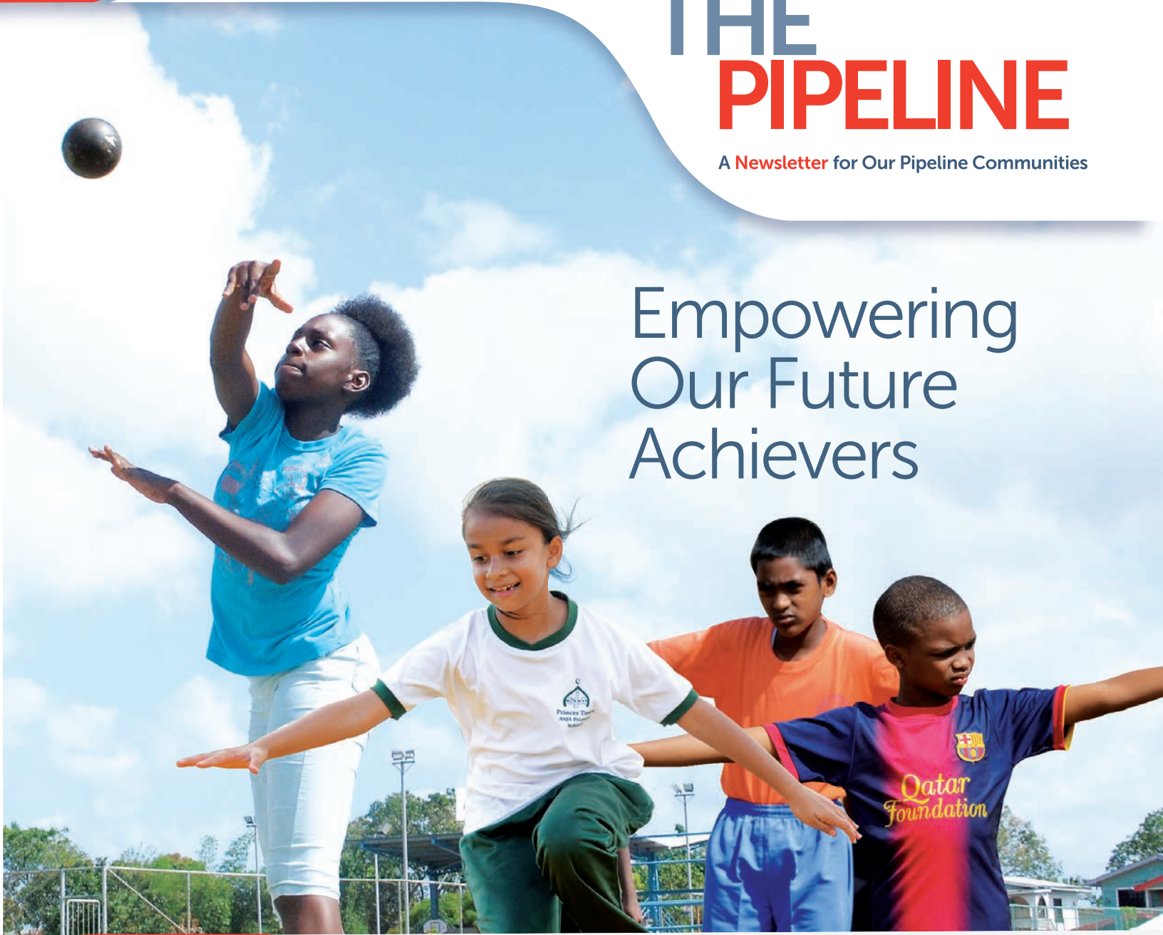
Children participating in NGC Right on Track programme in Edinburgh, Chaguanas