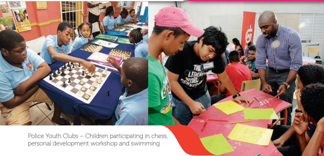
Police Youth Clubs – Children participating in chess, personal development workshop and swimming