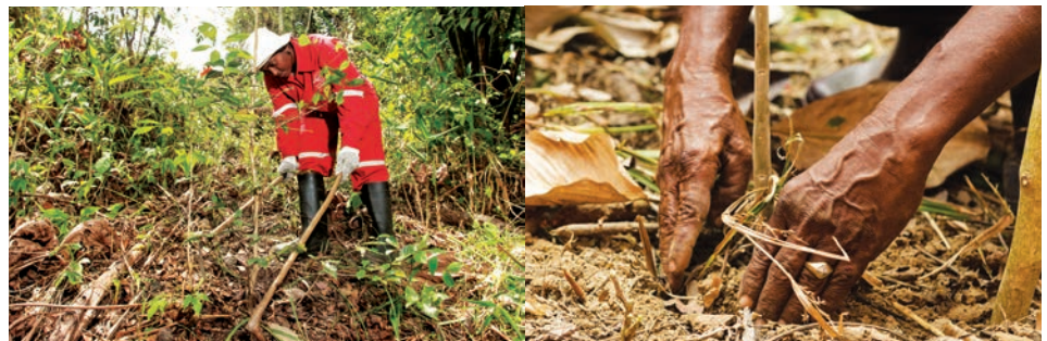
Reforestation – Community groups tending to young trees

Phase III of the programme spanned 2011 to 2015, and was centred around the areas of Edward Trace, Moruga, and in the Mome L'Enfer Forest Reserve at Grant's Trace and