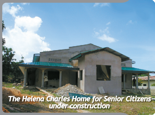
The Helena Charles Home for Senior Citizens under construction