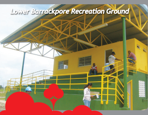
Lower Barrackpore Recreation Ground