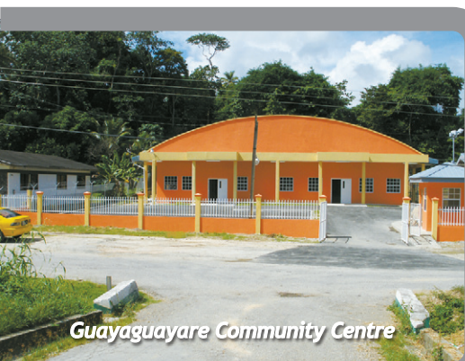
Guayaguayare Community Centre