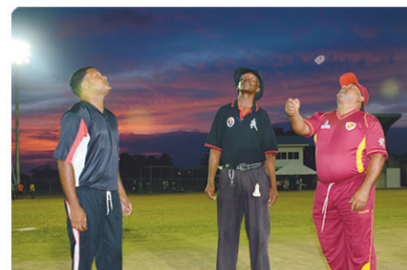
The Captains of Korea Village and Caldrac Sports Club toss to begin the first PEP T20 match.